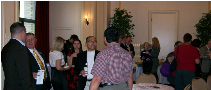
Building business bridges from the Bay Area to Montana.