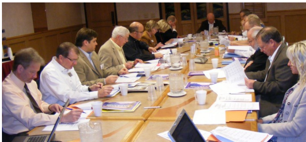
Your board at work.