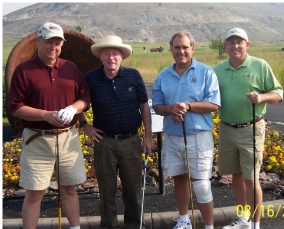
2007 The UofM Missoula