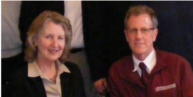
Montana Ambassador “Producers” -