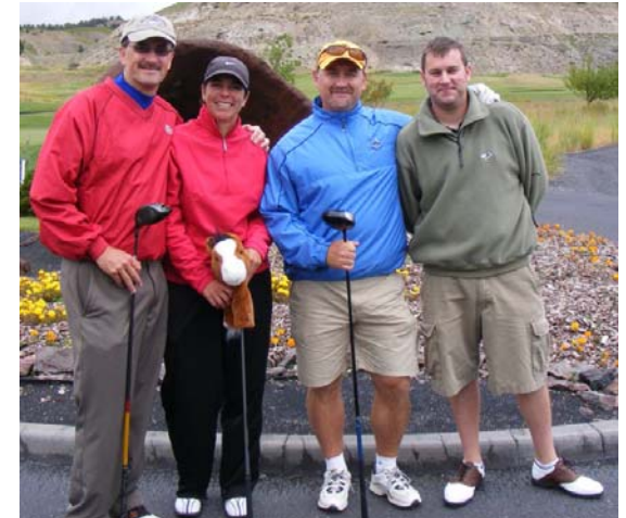
2008 Three Guys and a Golfer

Plan to attend the event where Business Education and Government meet to network and help to create MONTANA'S FUTURE