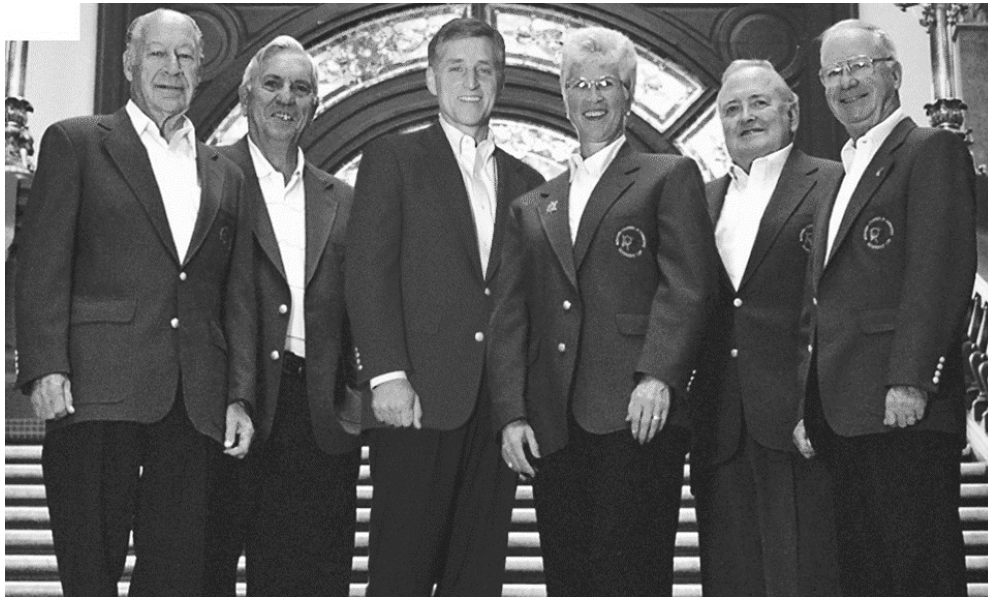
Governors Babcock, Schwinden, Racicot, Martz, Judge and Stephens