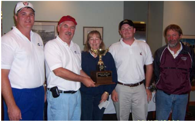
2006 Glacier Bank

Plan to attend the event where Business Education and Government meet to network and help to create MONTANA'S FUTURE