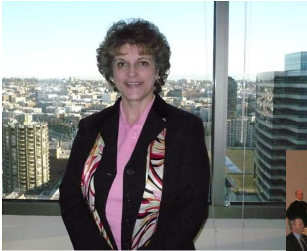
Seattle (PNW Chapter)