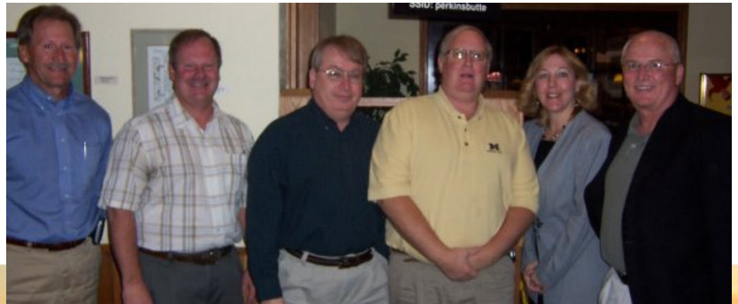
Butte Chapter Meeting