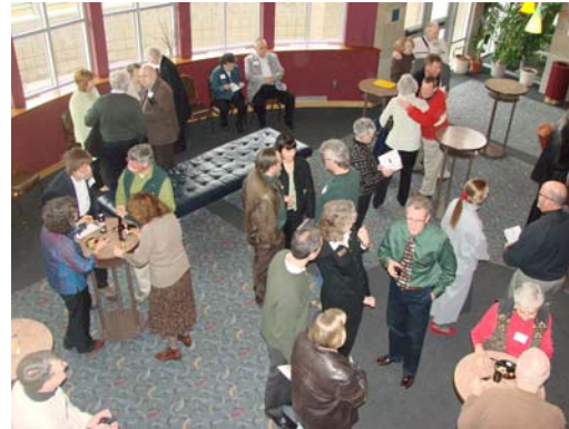
2008 Governor’s Arts Awards Celebration